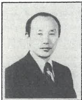
DR. PAUL YONGGI CHO